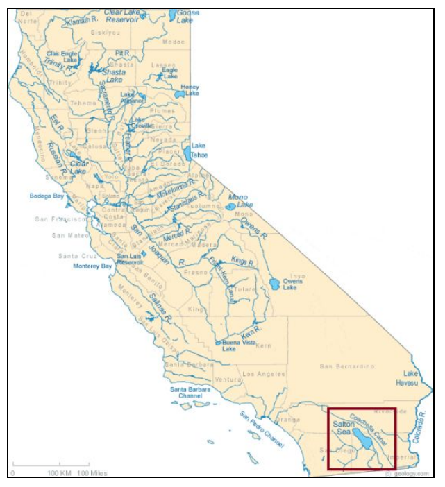
Figure 1:Map of California, showing the rivers and counties. Location of the Salton Sea shown by red bounding box.

The aim of this study is to analyse and quantify past changes in surface area and lake volume, related to decreasing lake levels. These trends will be used to make first-order projections of future surface areas and volumes as the lake levels continue to fall. These future projections are important in understanding the potential amounts of exposed lakebed that will be susceptible to erosion, which has important implications for human health in the nearby regions.